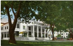
10 Most Note Card Covers