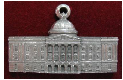
Actual size of ornament pictured.

This limited edition pewter ornament features the Old State Capitol in Jackson which served as the Mississippi seat of government from 1839 to 1903. The ornament is 2 inches wide by 1 inch tall and can be used as an ornament or worn on a necklace or as a pin. A brief history of the building is included with the ornament, which comes in a sealed package.