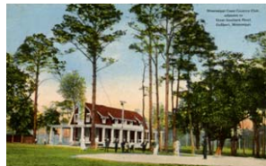
Lost Treasures of the Coast Note Card Covers

The Lost Treasures note cards are reproductions of historic postcards of sites from the Mississippi Coast that were lost during Hurricane Katrina in 2005. Two images of each of the following sites are included in each pack of note cards: Old Pass Christian Library, Merchants Bank - Bay St. Louis, Great Southern Golf and Country Club - Gulfport, Anderson Park Pavilion - Pascagoula, and the Father Ryan House - Biloxi. Information about each site is printed on the back side of the card. Cards are 3 ½ by 5 ½ inches and come with envelopes.