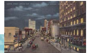
King Edward Note Card Covers

The 10 Most note cards are reproductions of historic postcards of sites that are on MHT's 10 Most Endangered List . Two images of each of the following sites are included in each pack of note cards: King Edward Hotel in Jackson, White House Hotel in Biloxi, Hawkins Field in Jackson, Houlika High School in Houlika, and Mississippi Industrial College in Holly Springs. Information about each site is printed on the back side of the card. Cards are 3 ½ by 5 ½ inches and come with envelopes.